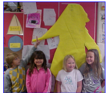
More Second Grade News on page 8