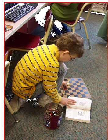
Study those moves !